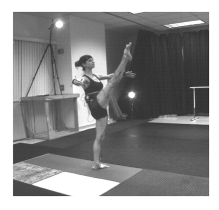
Figure 1: Dancer doing grand battement devant, in live time